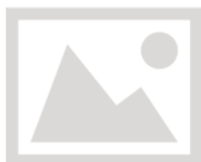
Immagine momentaneamente non disponibile